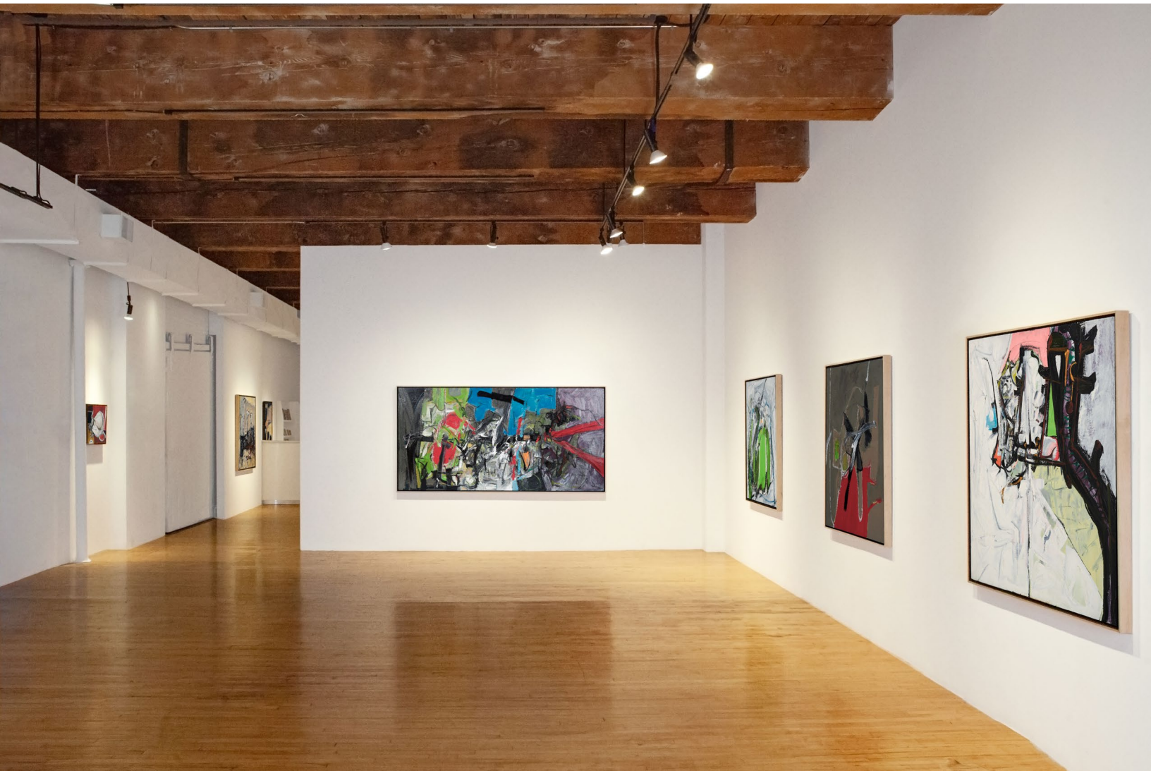
south gallery, north wall