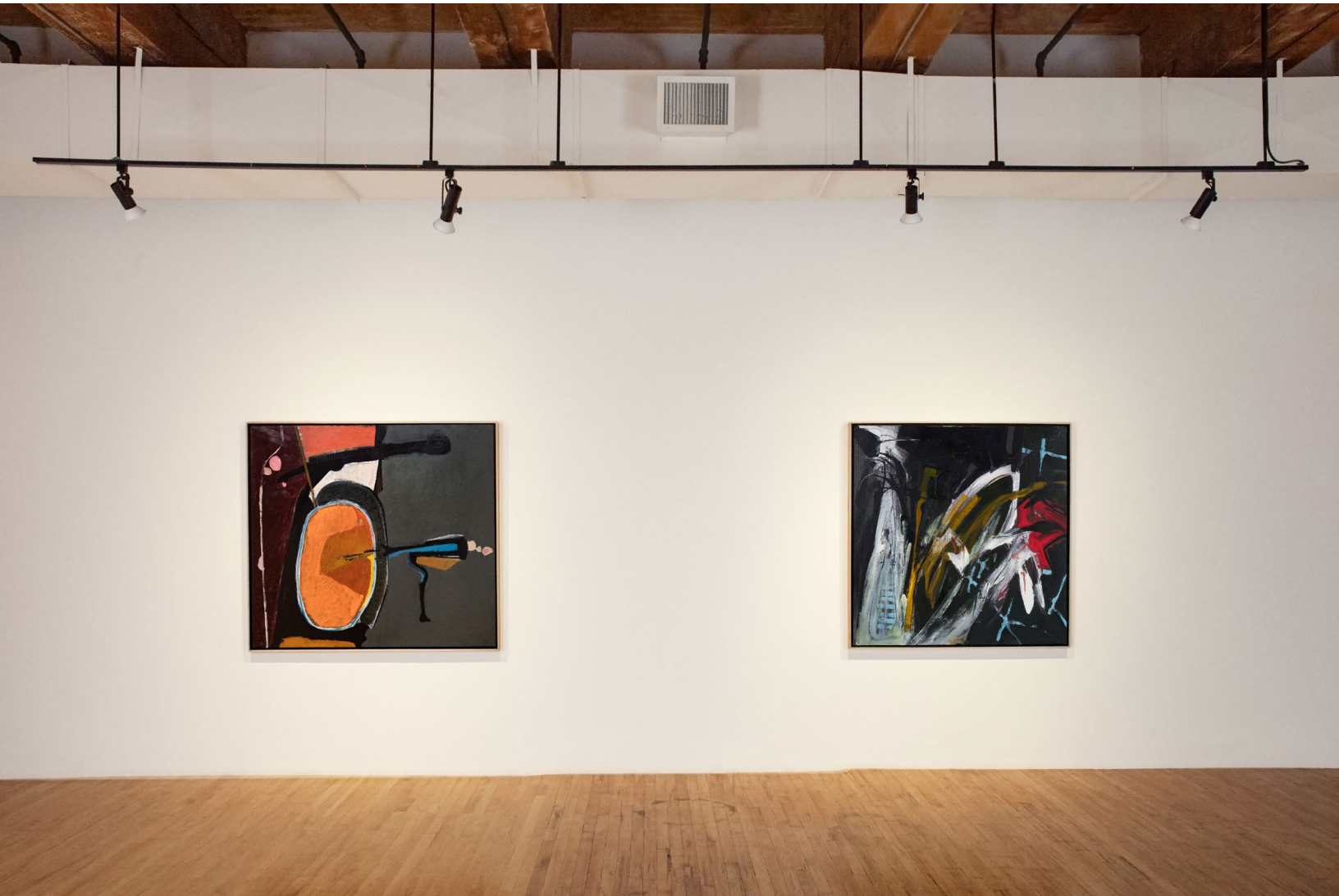
south gallery, west wall