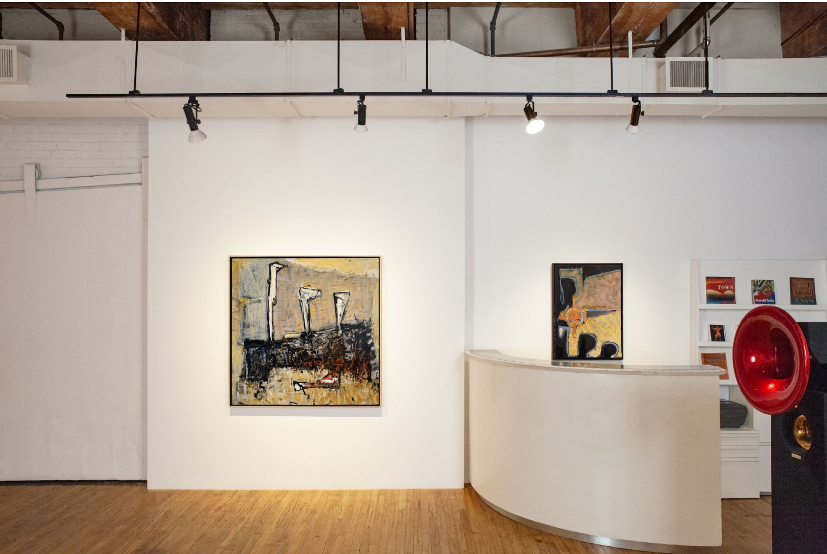
north gallery, west wall