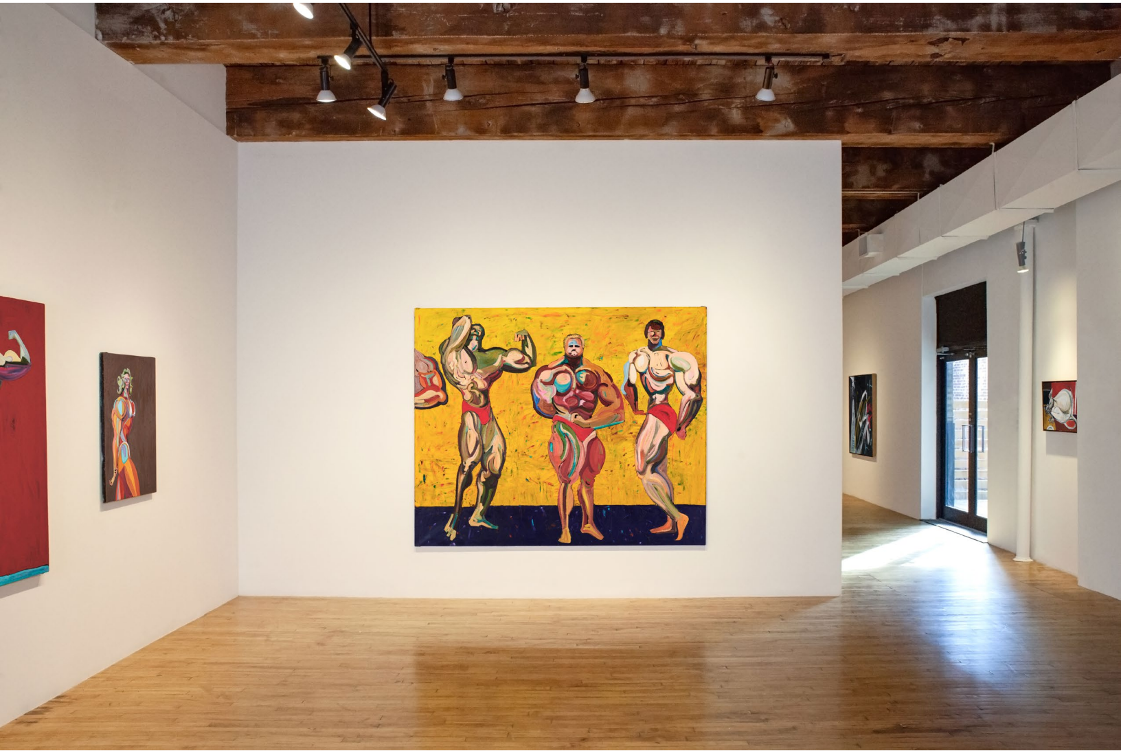
north gallery, south wall