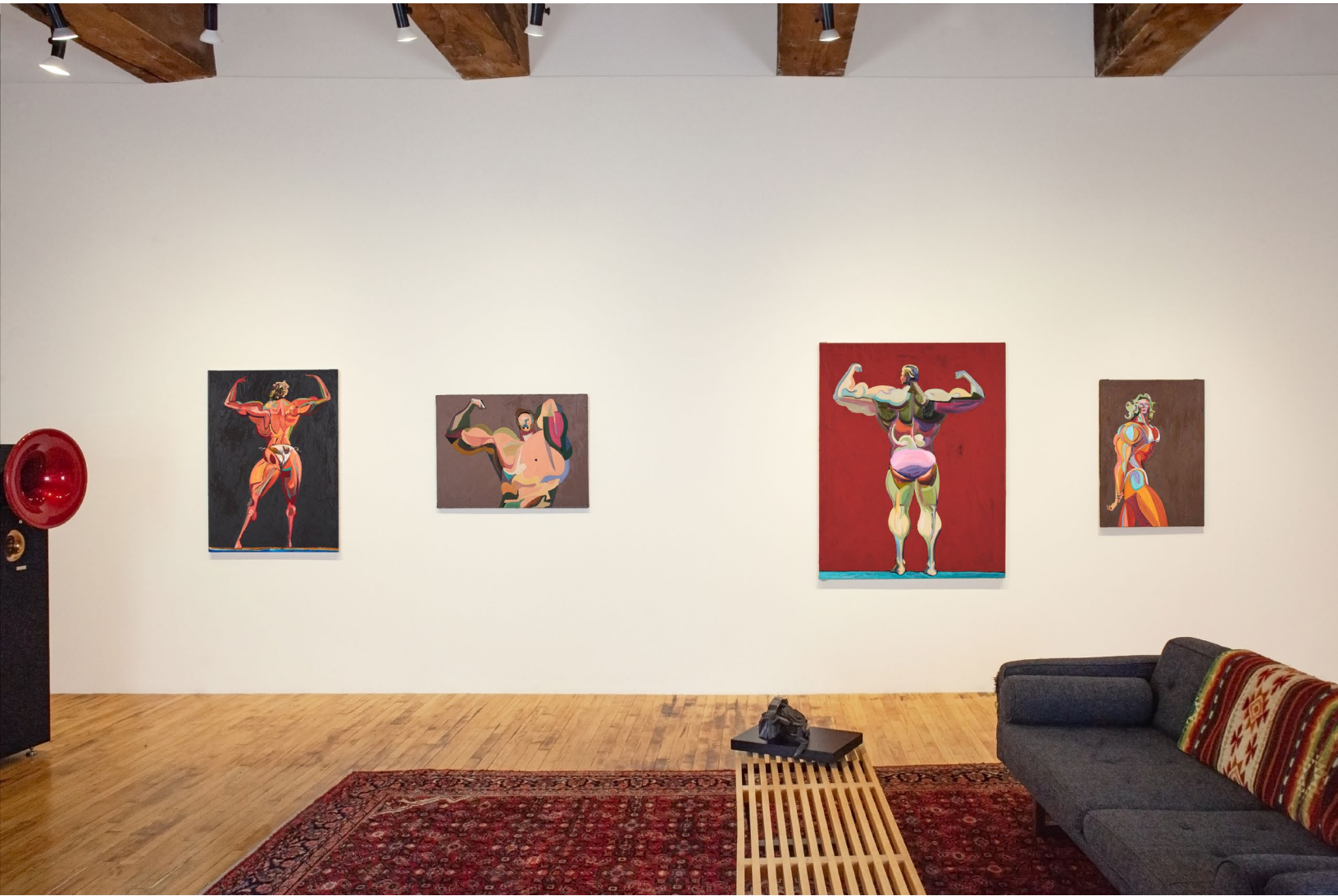
north gallery, east wall