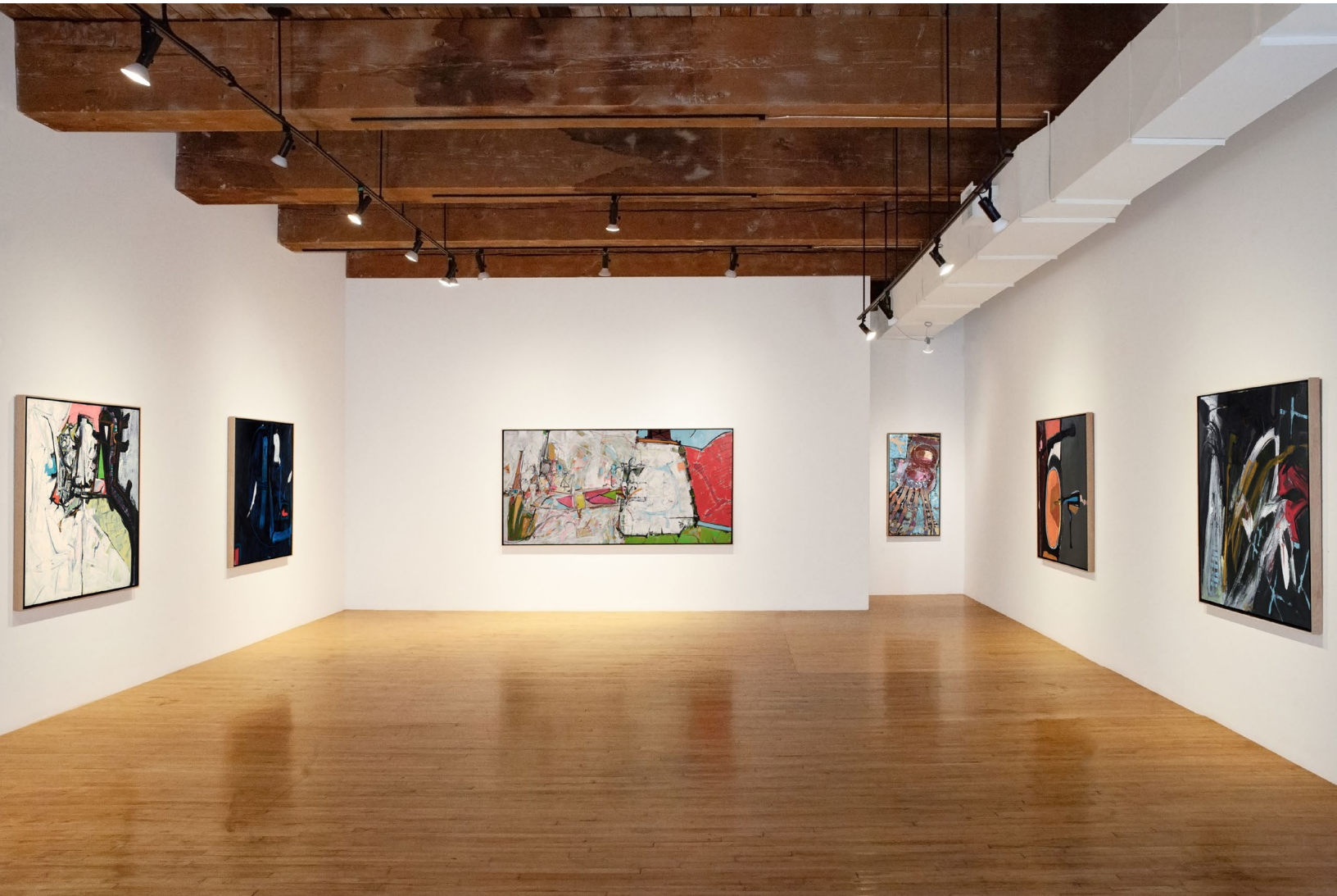
south gallery, south wall