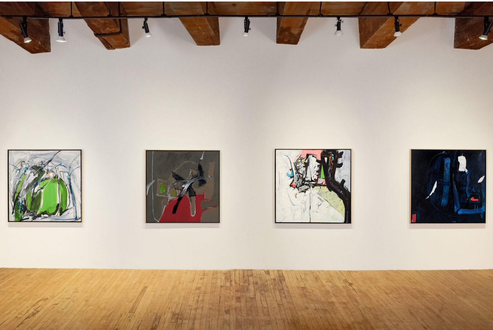
south gallery, east wall