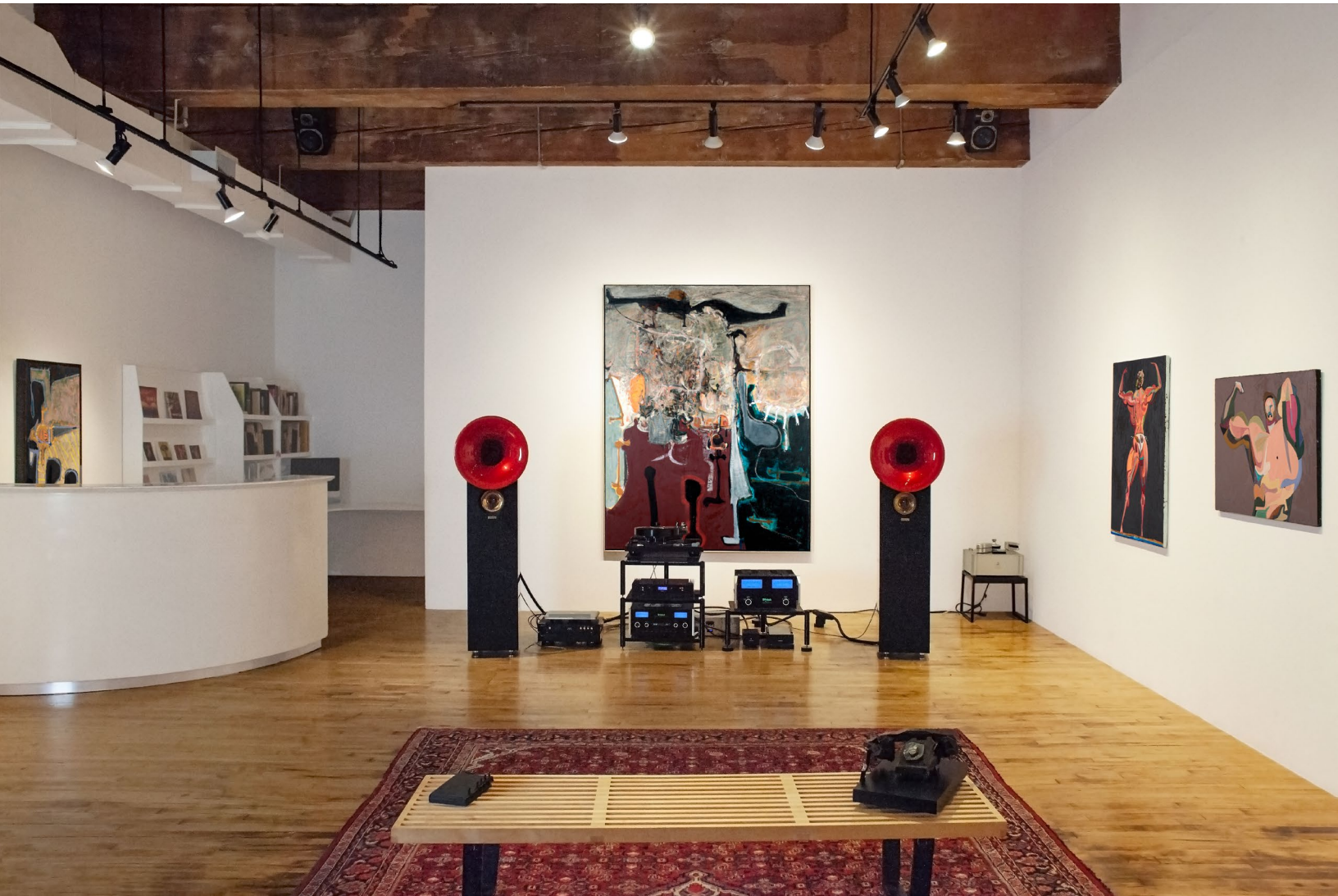
north gallery, north wall