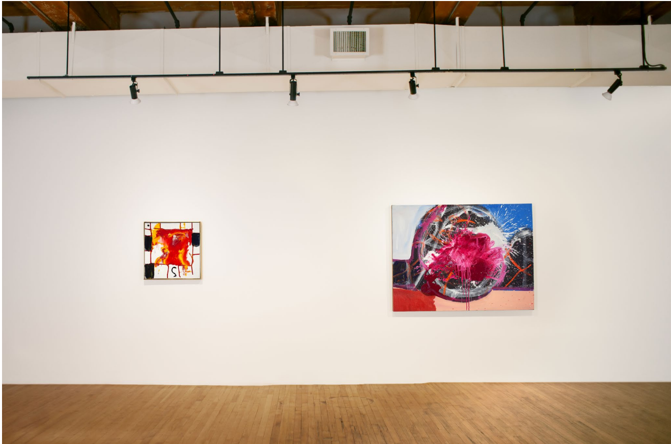
south gallery, west wall