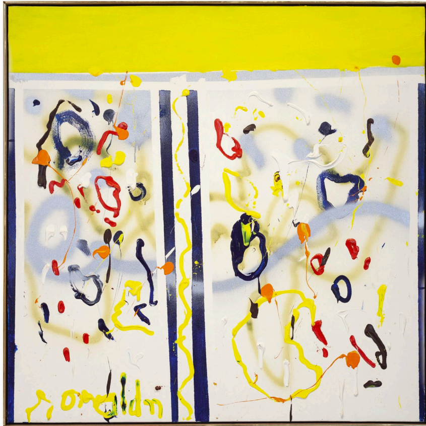
WILLIAM RONALD Akira Kawakida 1977 mixed media 48 x 48 inches (122 x 122 cm)