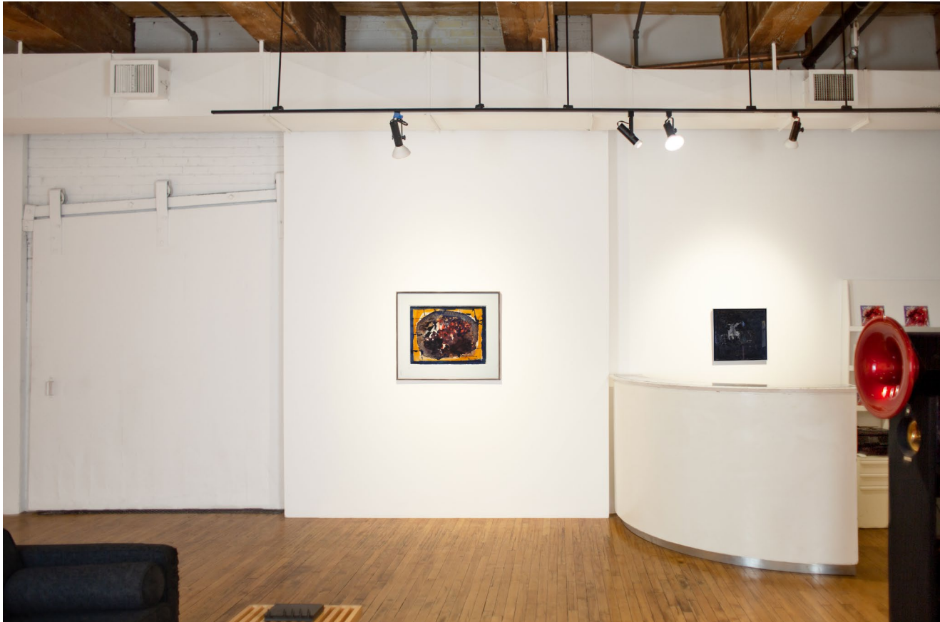
north gallery, west wall