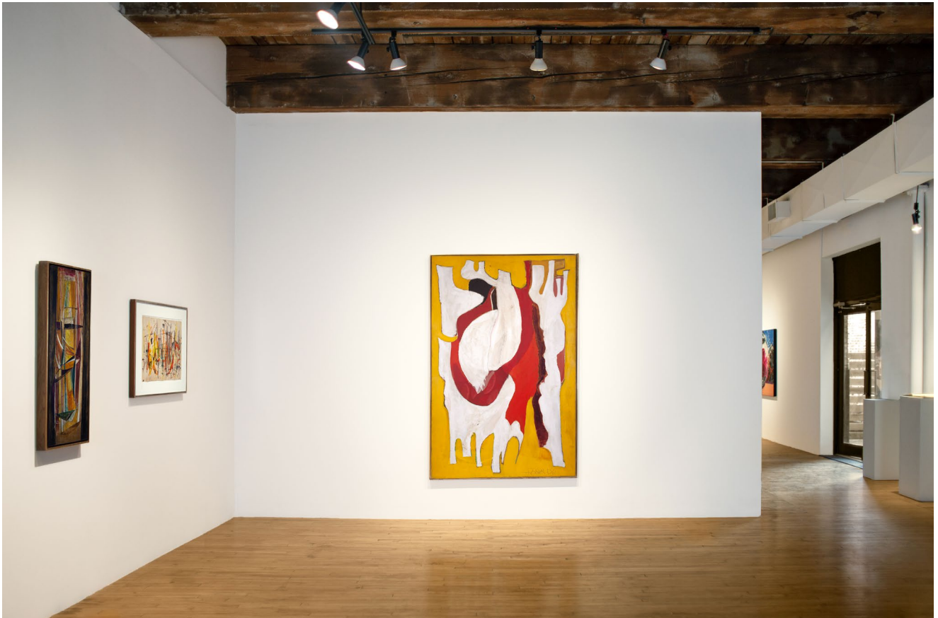
north gallery, south wall