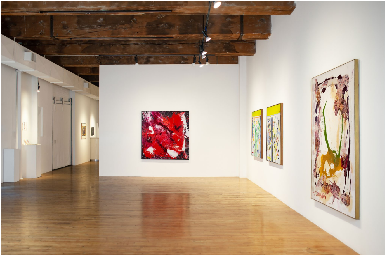
south gallery, north wall