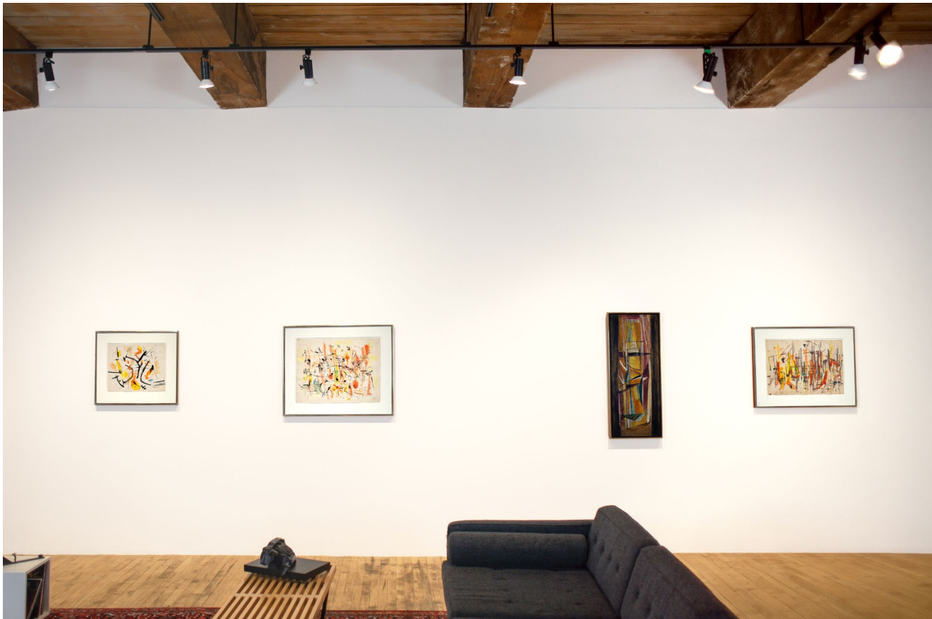
north gallery, east wall