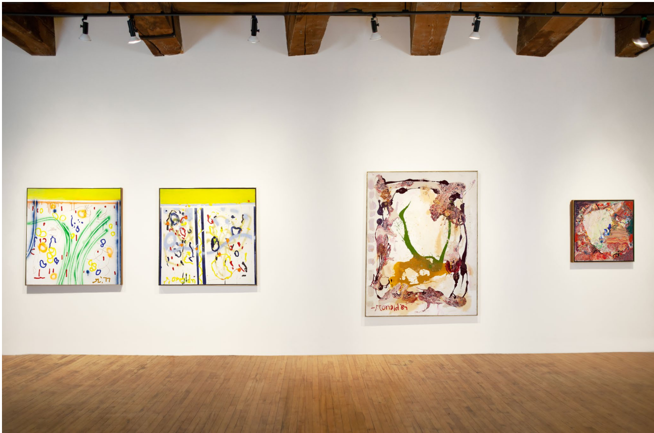
south gallery, east wall