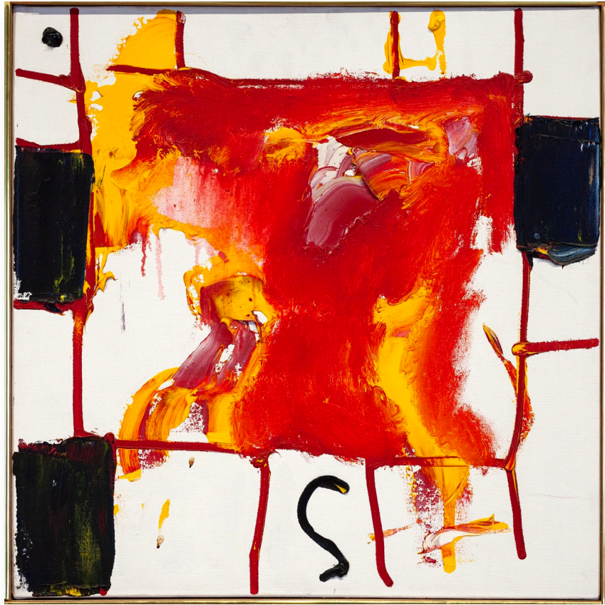
WILLIAM RONALD Allan Fleming 1978 acrylic on canvas 24 x 24 inches (61 x 61 cm)