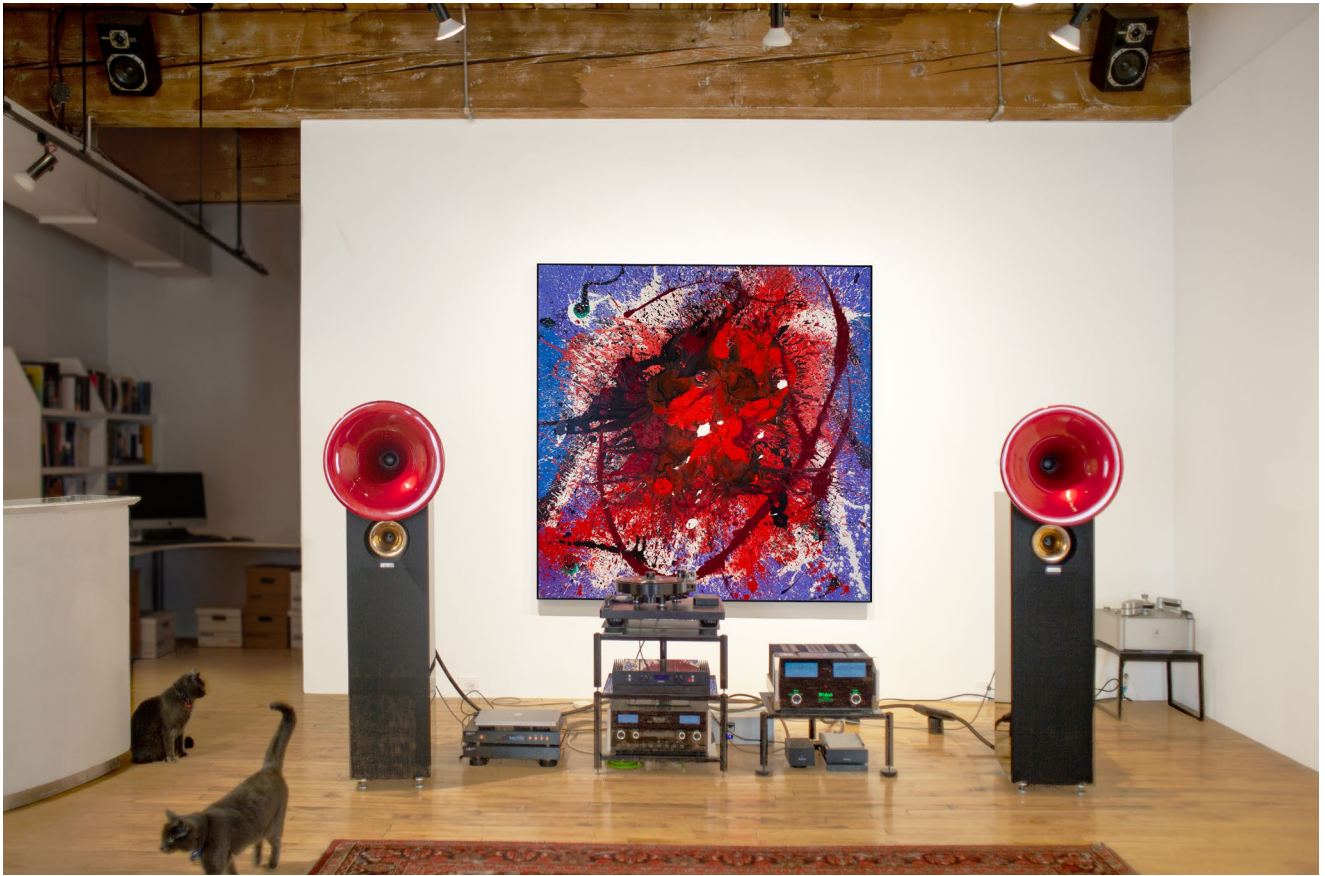
north gallery, north wall