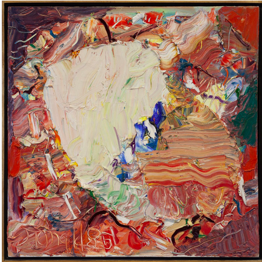
WILLIAM RONALD That's Amore 1985 oil on canvas 30 x 30 inches (76 x 76 cm)