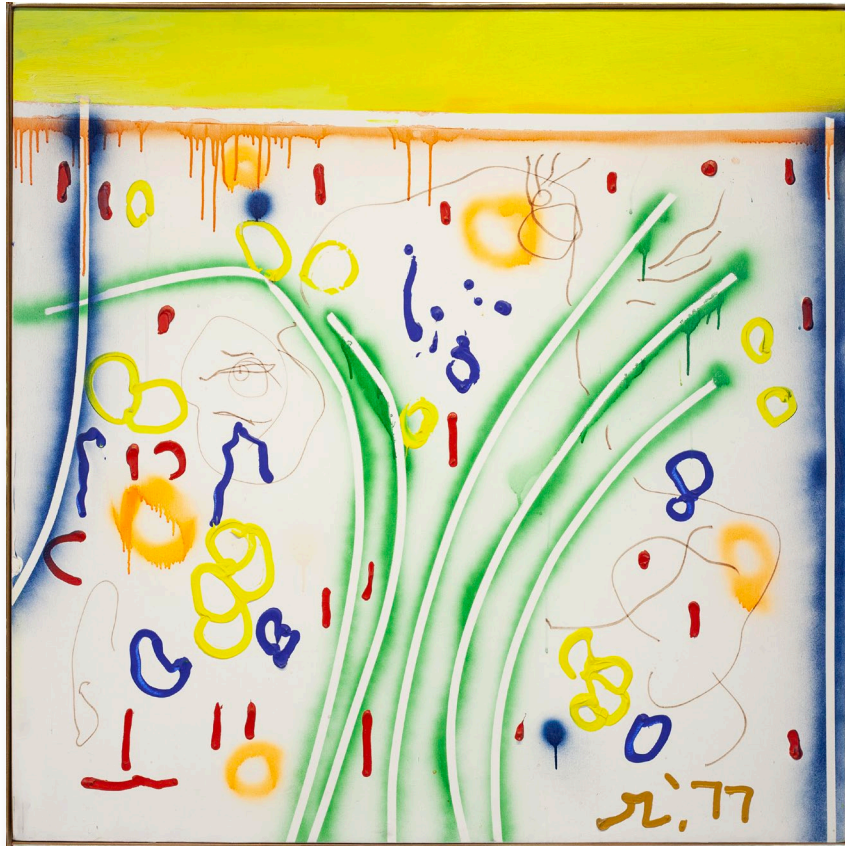
WILLIAM RONALD Bim Bam 1977 mixed media 48 x 48 inches (122 x 122 cm)