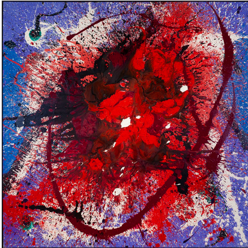
WILLIAM RONALD Untitled 1998 acrylic on canvas 72 x 72 inches (183 x 183 cm)