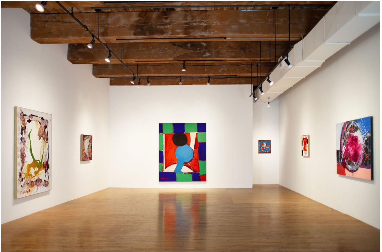
south gallery, south wall