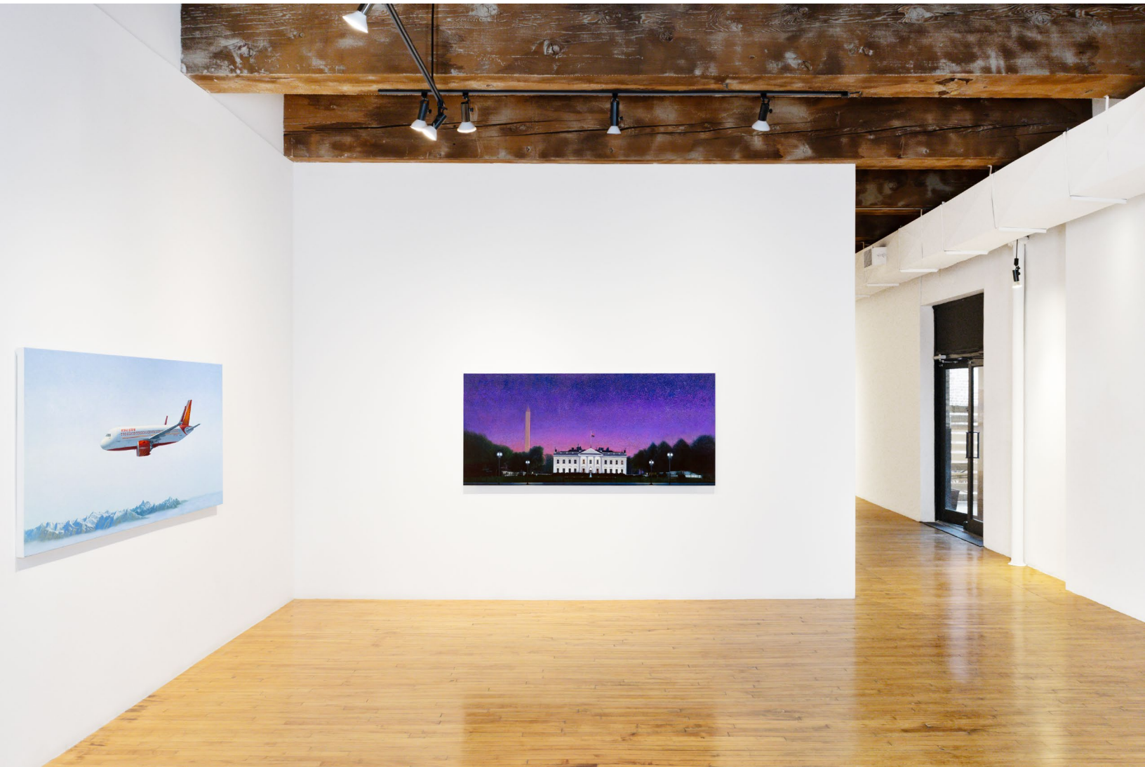
north gallery, south wall