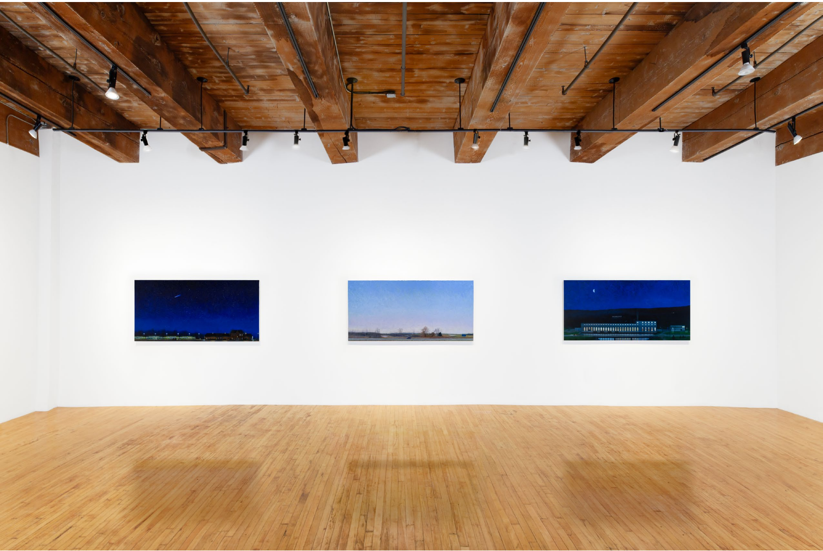
south gallery, east wall