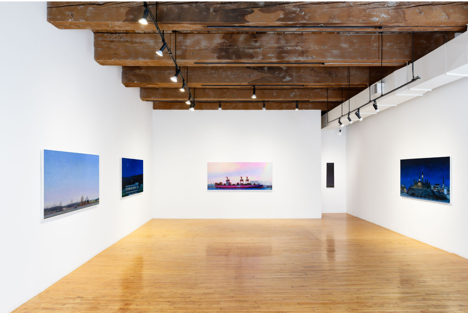
south gallery, south wall