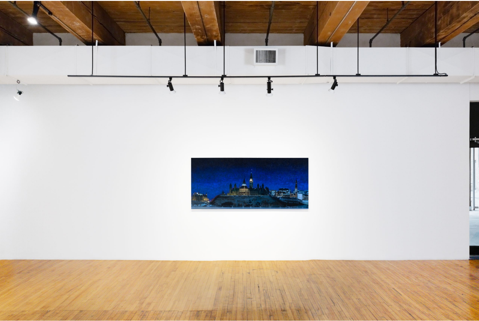
south gallery, west wall