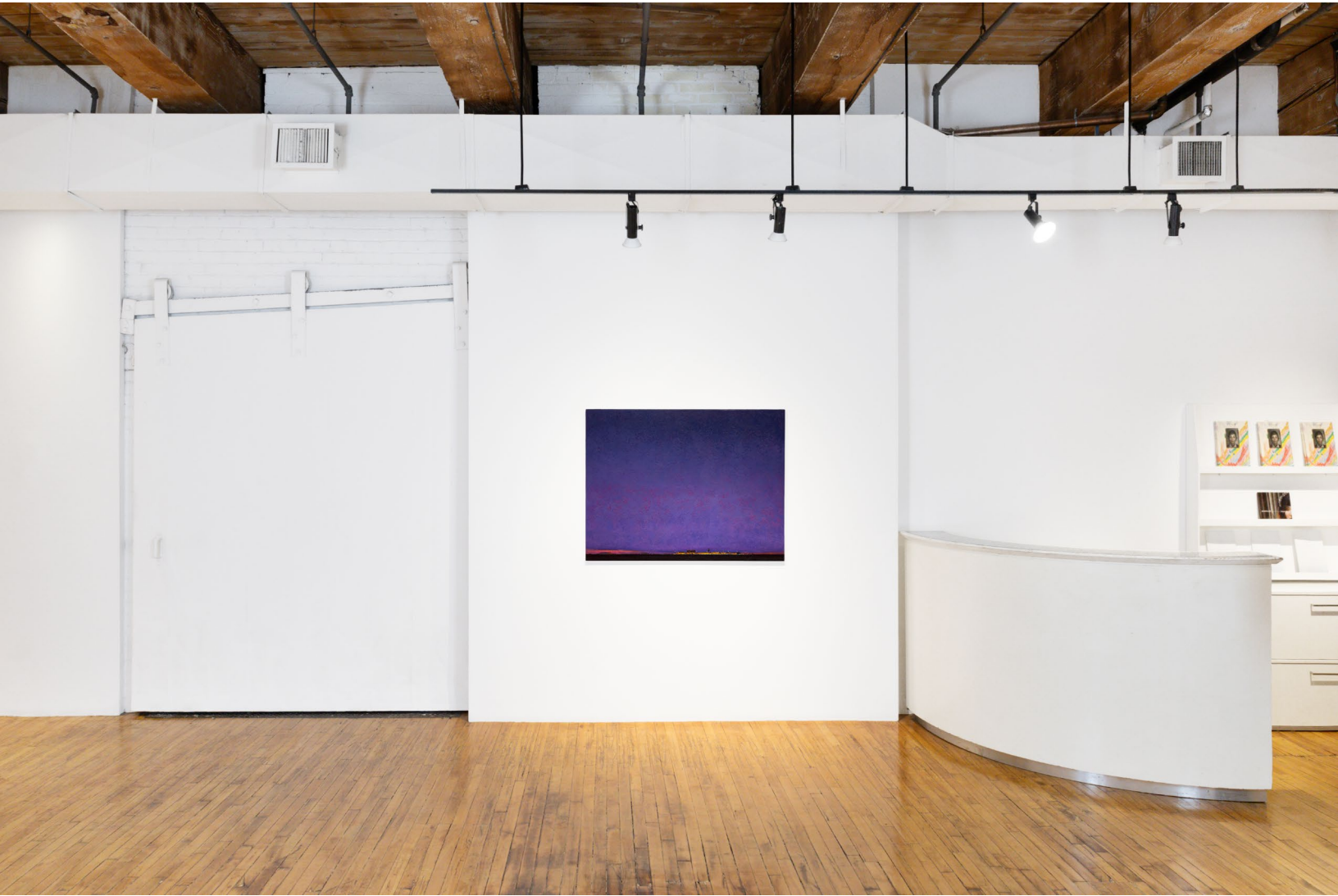
north gallery, west wall