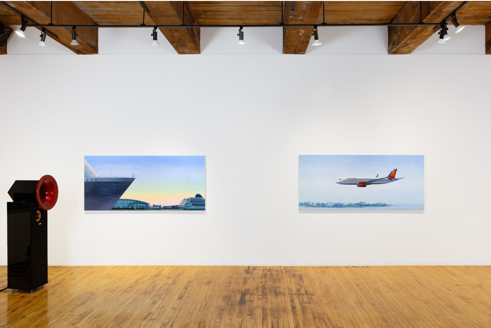
north gallery, east wall