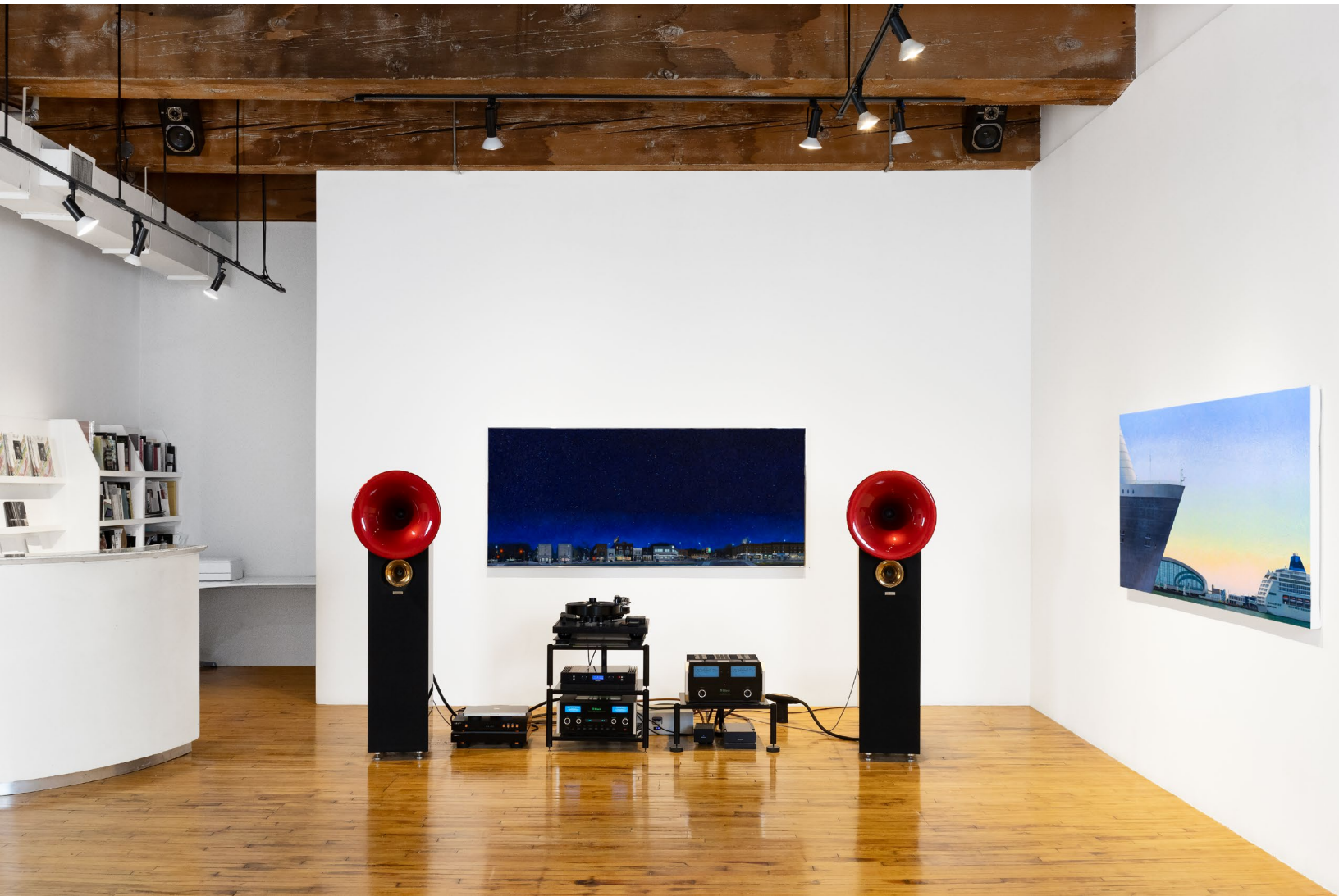
north gallery, north wall