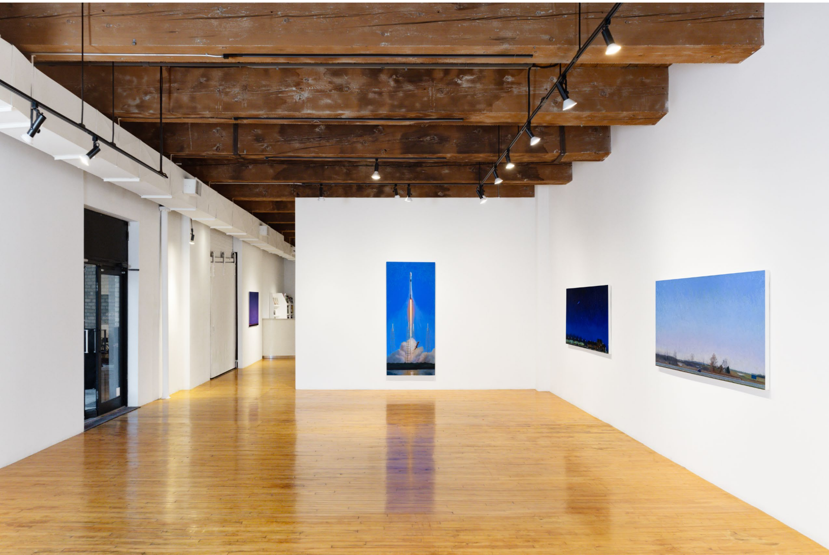
south gallery, north wall